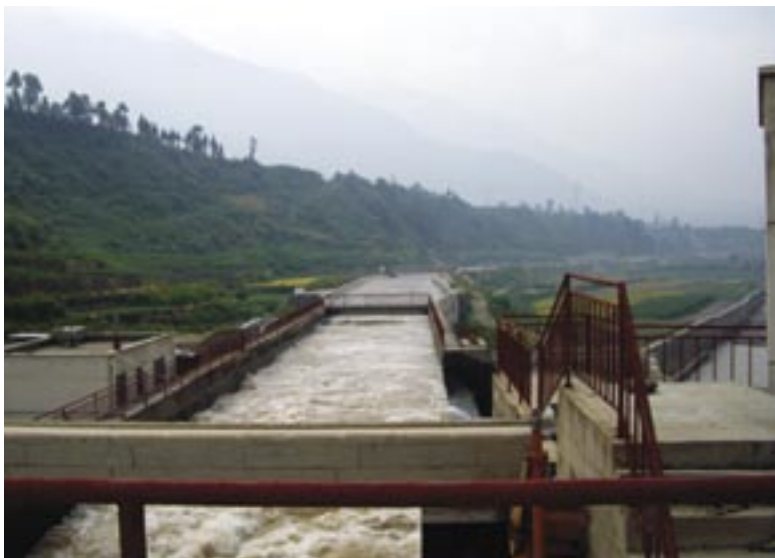
Main growth engine going forward

In June this year, APC also secured the rights to develop up to 28 hydropower electricity generation plants with a total installed capacity of 202MW across the Yunnan Province. For the reason that the investment capital required for all 28 hydropower plants stands at an estimated Rmb1.2b, construction works for these plants will be spread over a period of time, so as to reduce the strain on the company's finances.